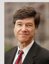
J. SACHS Director of the Earth Institute Columbia University