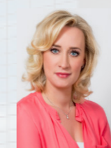
E. JINEK Talkshow host and journalist