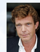
J.H.H. DE MOL Dutch Mediatycoon