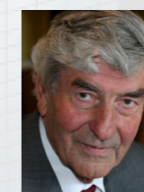
R.F.M. LUBBERS Former Prime Minister The Netherlands