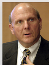
S. BALLMER Former CEO & Co-founder Microsoft