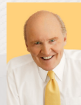
J. WELCH Former CEO General Electric Co.