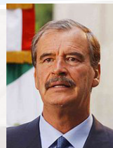
V. FOX QUESADA Founder President United Mexican States