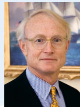
M.E. PORTER Professor Harvard University