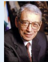
B. BOUTROS-GHALI Former Secretary-General United Nations