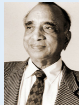
M.L. MITTAL Founder ISPAT International