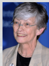
C. BELLAMY Former Executive Director UNICEF