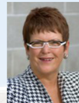
J. SHIPLEY Former Prime Minister New-Zealand