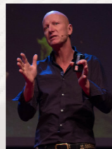
J. NELSON Photojournalist "Before they pass away"