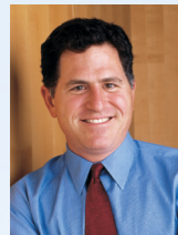
M. DELL Founder & Chairman Dell Inc.